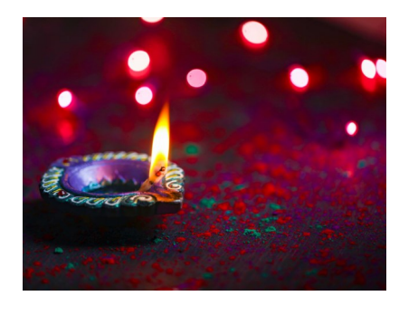
Monday 24th October - Diwali Show in Ghanshyam Hall from 3:00pm.

Monday 31st October - National Cat Day (29th) - We will try to arrange for a cat to visit the nursery. If parents know anyone with a pet cat that is healthy and has had all it's treatments, please speak to management.